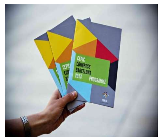
CONGRESS PROGRAMME Full-page ad € 1.500 Half-page ad € 890