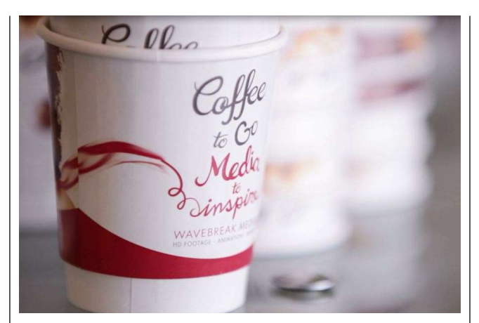
PAPER CUPS FOR COFFEE BREAKS € 2.000 + COSTS OF PRODUCTION

Amount: 450 – Contact us for information on sizes.