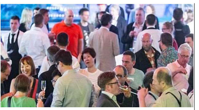
WELCOME RECEPTION FOR 200 GUESTS € 7.000

Welcome the delegates the evening before congress begin and ensure your presence right from the start. 200 guests are expected in the bar of the Maritim proArte Hotel. This is an exclusive sponsorship.