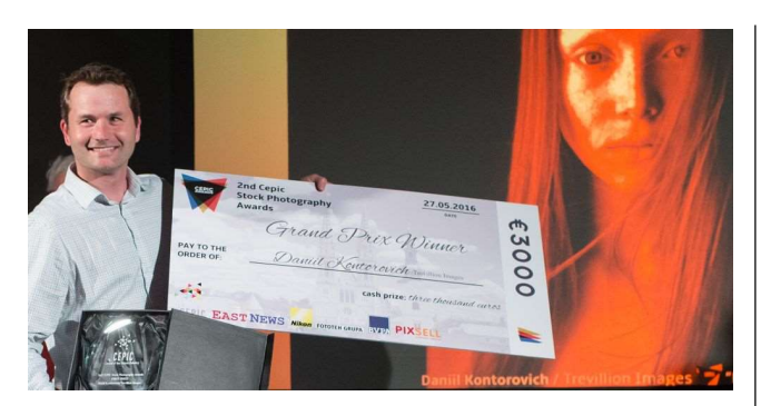
STOCK PHOTOGRAPHY AWARDS 1<sup>st</sup> prize € 5.000, 2<sup>nd</sup> prize € 3.000, 3<sup>rd</sup> prize € 2.000

Sponsor the third edition of the CEPIC Stock Photography Awards and increase your brand presence among photographers.