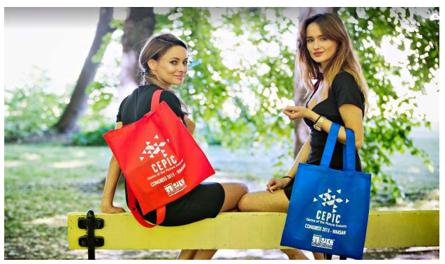
DELEGATES BAGS € 2.500 + COSTS OF PRODUCTION BENEFITS