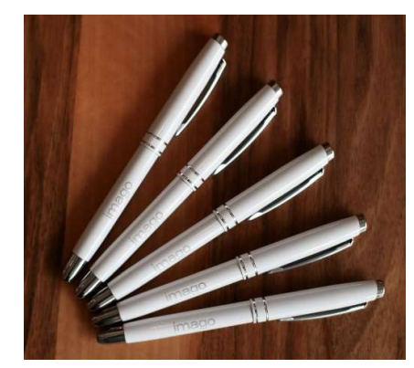
CONFERENCE PENS € 900 + COSTS OF PRODUCTION