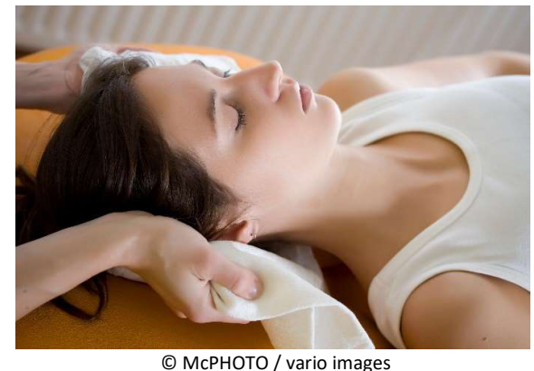
MASSAGE STATION € 1.900

Link your brand to the massage station and delegates will definitely remember and thank you. This sponsorship includes the work of 2 masseurs for three days (6 hours per day), 2 massage chairs.