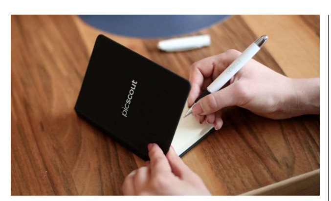
CONFERENCE NOTE PADS € 900 + COSTS OF PRODUCTION