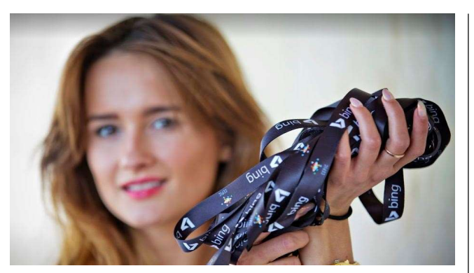
CONGRESS LANYARDS € 3.500 + COSTS OF PRODUCTION BENEFITS